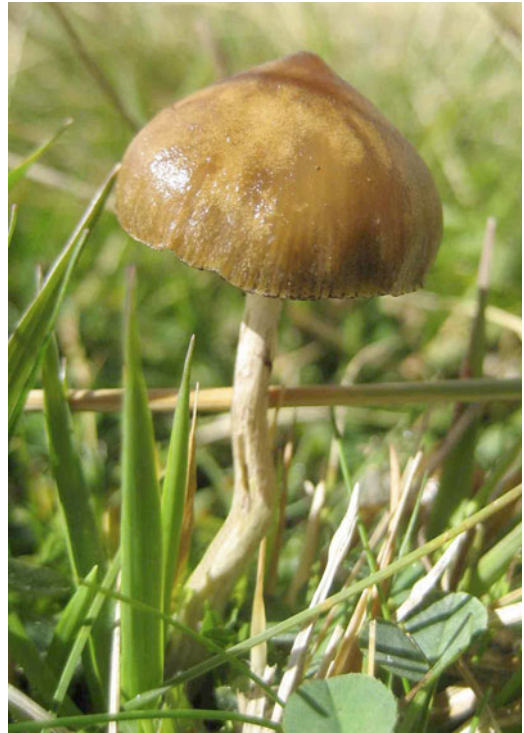
Fig. 2. Psilocybe hispanica Guzmán.

Habitat data also correlate with the identification tentatively suggested here. Psilocybe hispanica is a coprophilic species, coinciding with the mural's association of bovine with fungal figures. This species has been collected so far only from